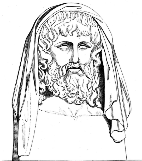
Fig. 1. Kronosbyst. Vatikanen.

Cronos see099: Bust of Cronos. Vatican. Otto Seemann, Grekernas och romarnes mytologi (1881).