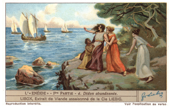
Aeneid liebaen1.4: Dido begged: "I implore you, and by our union of hearts, by our marriage hardly begun, if I have ever helped you at all, if anything about me pleased you, be sad for our broken home, forgo your purpose, I beg you, unless it is too late for prayers of mine!" (Dido to Aeneas. Virgil, The Aeneid 4.315). But Aeneas, listening to higher calls, left her, and she killed herself. That is why they chant: "Aeneas caused her death and lent the blade, Dido by her own hand in dust was laid." (Ovid, Heroides 8). Liebig sets.