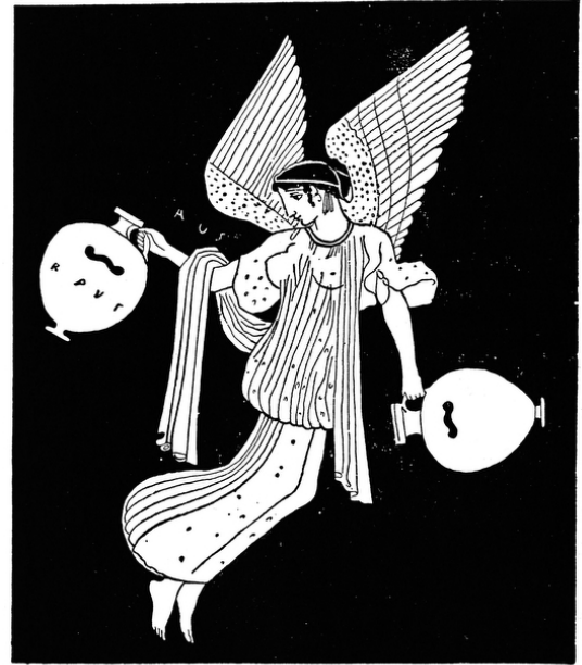
EOS GJUTANDE DAGG ÖVER JORDEN. Grekisk vasmålning.