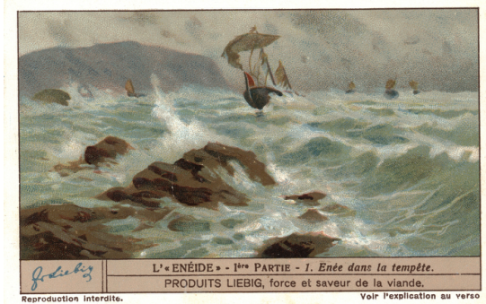
The storm liebaen1.1: On its way to Italy, a storm sent by Hera (who had not forgotten the outrage she suffered at Mount Ida on the occasion of the Judgement of Paris), carried Aeneas' fleet to Libya, where there was a city Carthage, ruled by Queen Dido. Liebig sets.