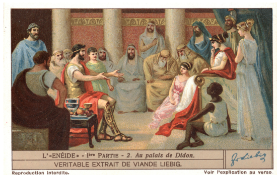
Aeneid liebaen1.2: Aeneas impressing Queen Dido with war anecdotes and accounts on Trojan bravery and Achaean treachery. Liebig sets.