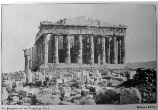
Der Parthenon auf der Akropolis zu Athen.