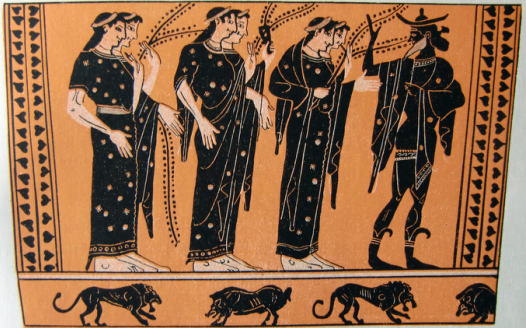
Hermes mit den Nymphen. Malerei auf einer schwarzfigurigen Hydria im Ashmolean-Museum, Oxford.