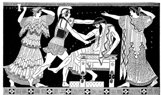
ORESTES HÄMNAS SIN FADERS DÖD. Grekisk vasmålning.