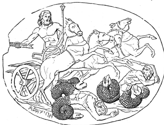
Fig. 2. Athenion-kamé. Neapel.

Zeus see010a: Zeus fighting the giants. Athenion cameo. Otto Seemann, Grekernas och romarnes mytologi (1881). © Maicar Förlag 1997 • www.maicar.com