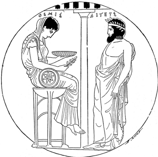
THEMIS SOM PYTHIA. Grekisk vasmålning.