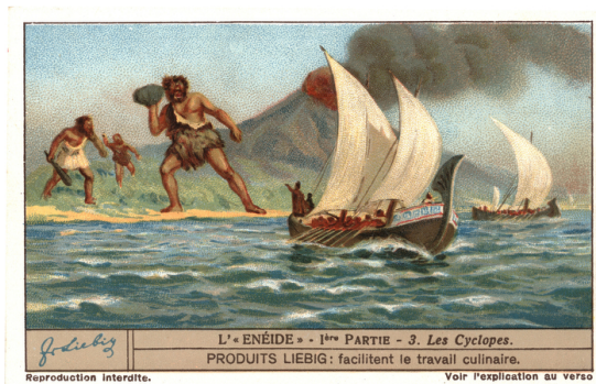
Aeneid liebaen1.3: This is part of the adventures that Aeneas related to Dido: Looking for rest Aeneas and his crew crept to the shores of the Cyclopes, an unfriendly and anthropophagous race. When this 'fraternity of the Aetna' discovered the intruders, they ran towards the beach. But Aeneas and his comrades were already on their way. Liebig sets.