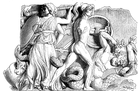
Fig. 4. Hekate-grupp. Relief från Pergamos. Berlin.

Hecate see011: Altar of Zeus, Pergamon, Berlin. Otto Seemann, Grekernas och romarnes mytologi (1881).