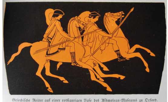
Griechische Reiter auf einer rotfigurigen Vase des Ashmolean-Museums zu Oxford.