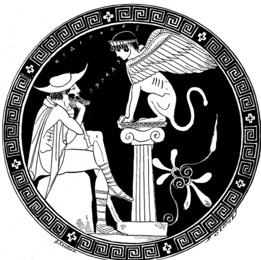
OEDIPUS OCH SFINXEN. Grekisk vasmålning.